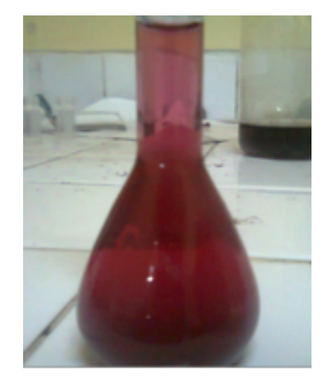
Figure 2. Photograph of Azo dye solution

The principle reaction of this method is diazoti-zation and following by coupling reaction to form red-violet azo dye solution as shown in Figure 2.